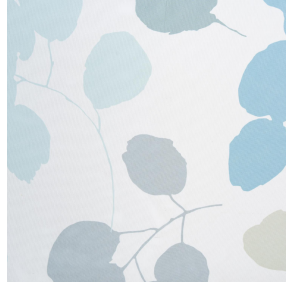
LIV PRINTEMPS 130 Print pattern