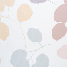
LIV AUTOMNE 205