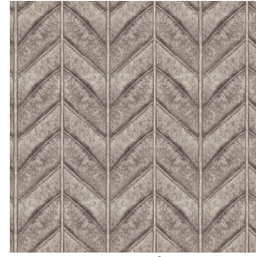
NERVURE Anthracite 38