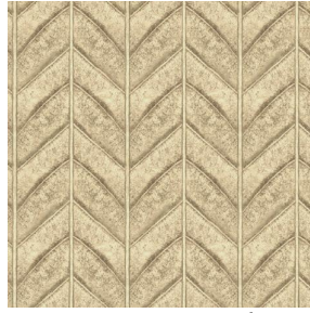
NERVURE Naturel 26