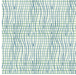
TARIM Brume 47 Print pattern