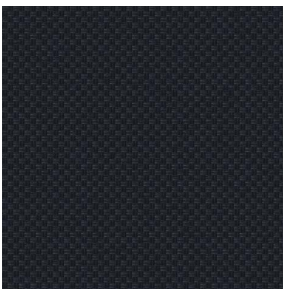
CHARLOTTE Noir 10