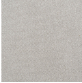
NOCLIN NATUREL 26 Printing support