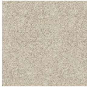
ELAINA Lin 11 Print pattern