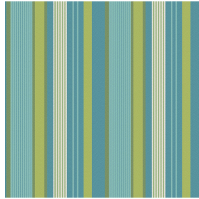
MELANIE Printemps 130 Print pattern