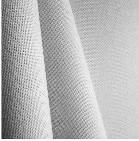
NOCTANE BPI 00 Printing support