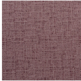
MURA ROSE 129 Print pattern