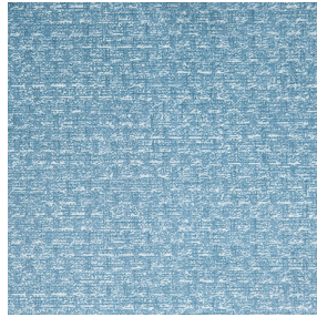
RUSTIC Glacier 43 Print pattern