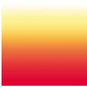
ZADIG Agrume 69 Print pattern