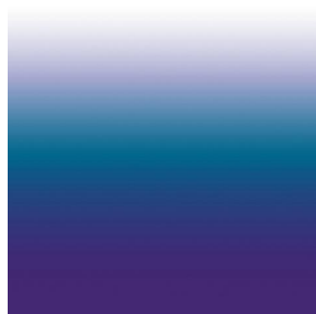
ZADIG Bleu 41