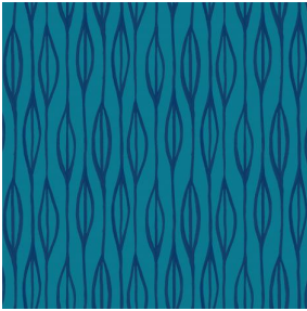
YENDI Pacifique 54