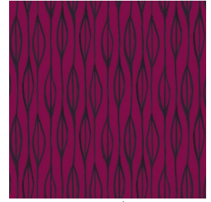
YENDI Opéra 104