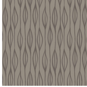
YENDI Terre 107 Print pattern