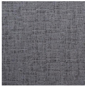
MURA ETAIN 180