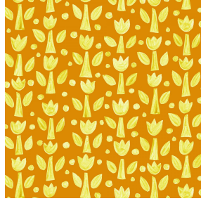
TULIPE Soleil 127 Print pattern