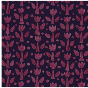
TULIPE Bordeaux 04