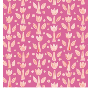
TULIPE Rose 129