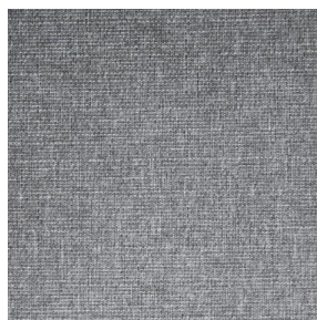
MUNA Sisal 140