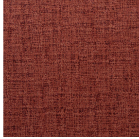
MURA GREMAT 56 Print pattern