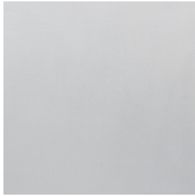
NOCTWIN BPI 00 Printing support