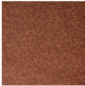
ANATOLE Chaudron 118