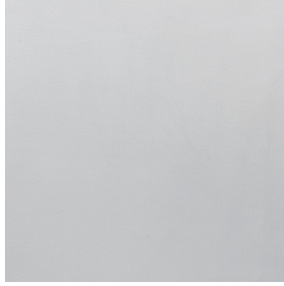
NOCTWIN BPI 00 Printing support