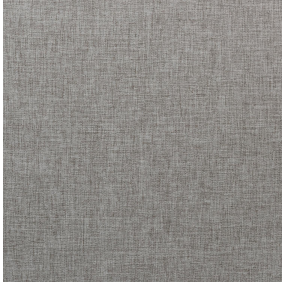
NORA Gris envers blanc 63 Printing support