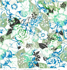
CHARMETTE Turquoise 53