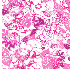
CHARMETTE Fuchsia 33 Print pattern