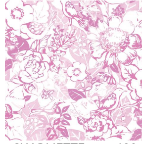
CHARMETTE rose 129