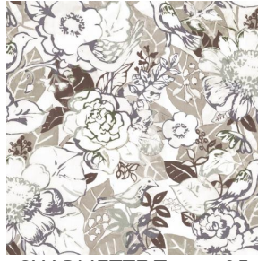
CHARMETTE Taupe 95