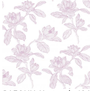
PAEONIA Hortensia 134