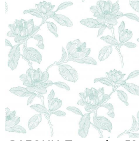
PAEONIA Turquoise 53