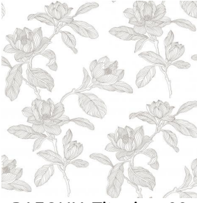
PAEONIA Titanium 98