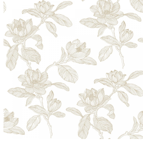
PAEONIA Beige 63 Print pattern