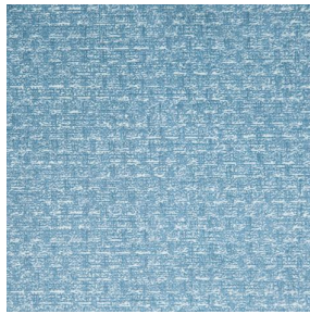
RUSTIC Glacier 43