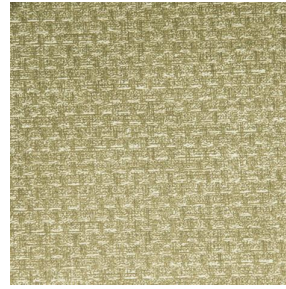
RUSTIC Bergamote 121