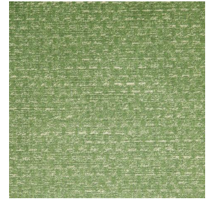
RUSTIC Mousse 92