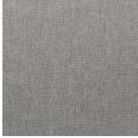
NORA Gris envers blanc 63 Printing support