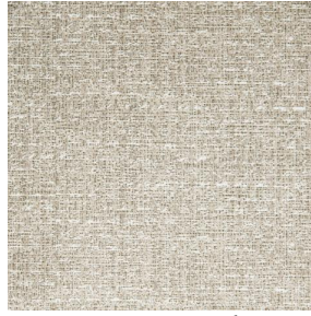
RUSTIC Naturel 26