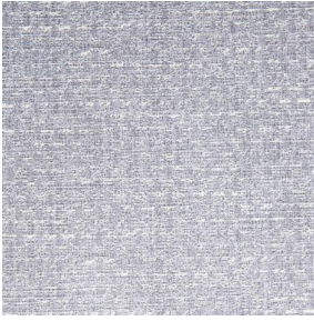
RUSTIC Lin 11