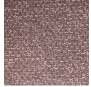
RUSTIC Terre 107