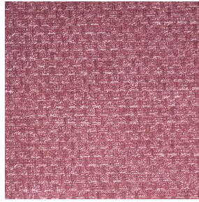
RUSTIC Hortensia 134