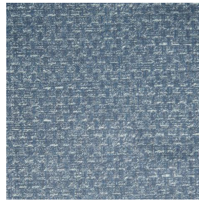
RUSTIC Bleu 41