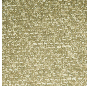
RUSTIC Bergamote 121 Print pattern