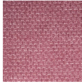
RUSTIC Hortensia 134