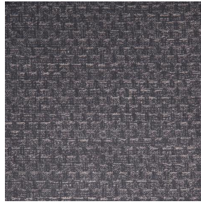
RUSTIC Titanium 98