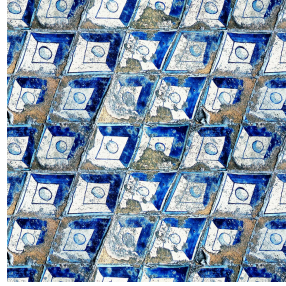
CLEMENTINA Azur 137 Print pattern