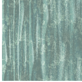
6042 Minéral 157 Print pattern