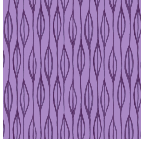
YENDI Lilas 19 Print pattern