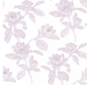
PAEONIA Hortensia 134 Print pattern