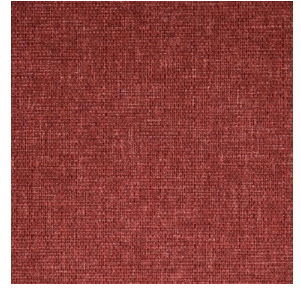
MUNA Rouge 21