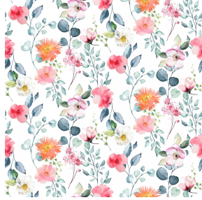
FLORES Multico 98 Print pattern