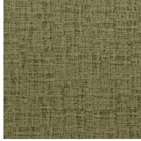
MURA OLIVE 61 Print pattern