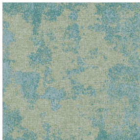
SIERRA brume 47