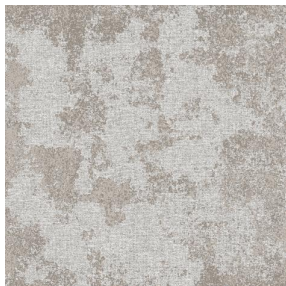
SIERRA ardoise 87