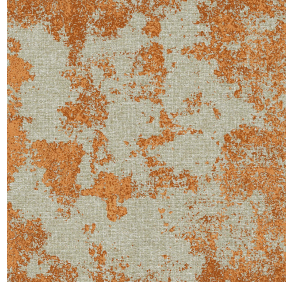
SIERRA chaudron 118 Print pattern