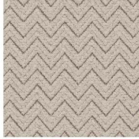
HOMER Lin 11 Print pattern