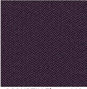
SCOURTIN Ébene 113