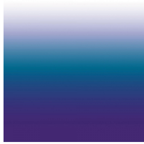
ZADIG Bleu 41 Print pattern