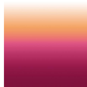
ZADIG Pivoine 57