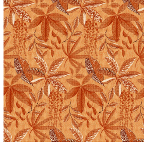
TROPIC Terracotta 65 Print pattern