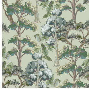
FORET Reflet 140 Print pattern