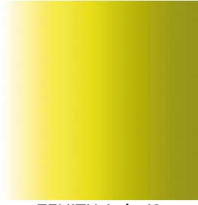
ZENITH Anis 62