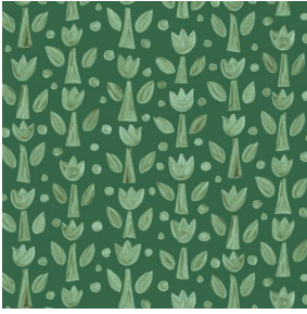
TULIPE Lierre 124