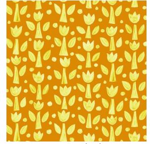
TULIPE Soleil 127