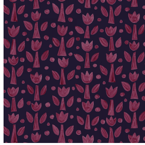
TULIPE Bordeaux 04 Print pattern