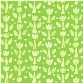
TULIPE Anis 62