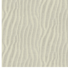
SABLE Lin 11 Print pattern