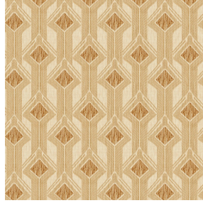
INDIA Naturel 26 Print pattern