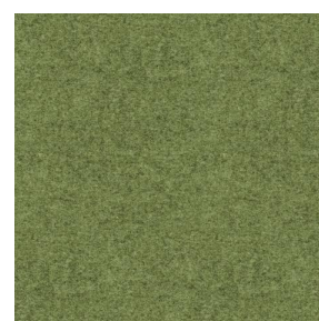
ELAINA Lierre 124