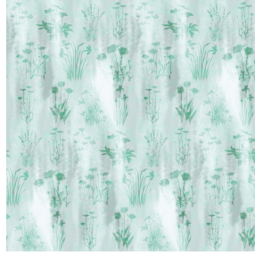
6054 Céladon 135 Print pattern