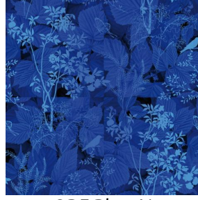
ODE Bleu 41