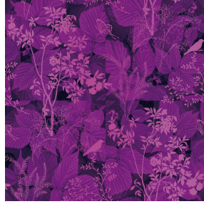
ODE Lilas 19 Print pattern