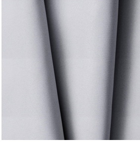
OPAQ BPI 00 Printing support