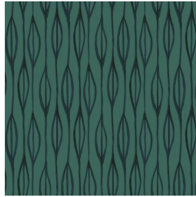
YENDI Sapin 126