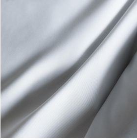
POL 00 Printing support