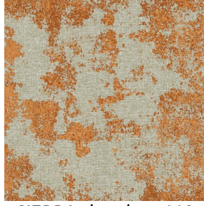
SIERRA chaudron 118