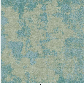
SIERRA brume 47