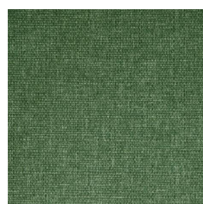
MUNA Lierre 124