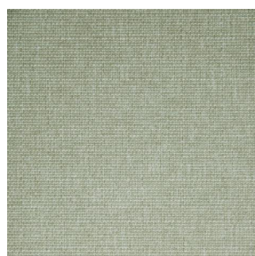
MUNA Sable 67