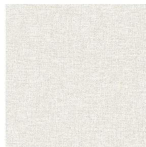
MUNA lin 11