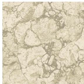
CARRARA Ficelle 09