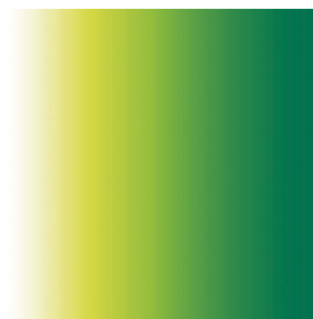
ZENITH Cactus 36